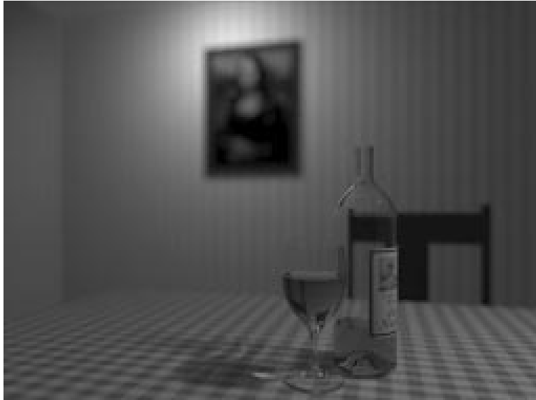
Figure 6.14: Zonal calculations allow for lighting through glass.