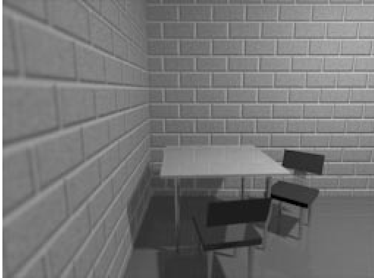
Figure 6.10: Radiosity with image based direct lighting calculation allows proper shading of bump maps.