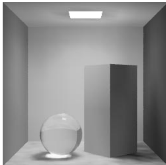
Figure 6.13: Zonal calculations allow for specular transport.