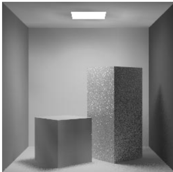
Figure 6.15: Block on right is reflector (not zonal). The rest of the scene is made up of reemitters.