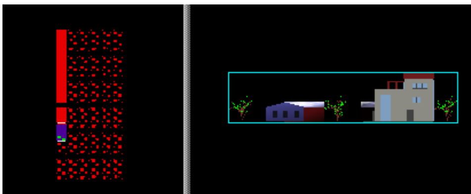
Figure B: Building of the model hierarchy