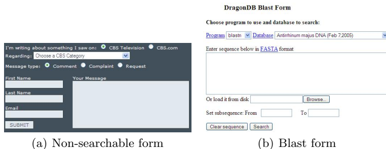
Fig. 2. Similarity of a non-searchable form in a commercial domain and a searchable form in the molecular biology domain.

some searchable forms in the molecular biology domain are structurally similar to non-searchable forms of commercial sites. The presence of features such as text areas, buttons labeled with the string “submit”, file inputs, are good indicators that a (commercial) form is non-searchable. However, these features are also present in many searchable forms in the molecular biology domain (e.g., Blast search forms). This is illustrated in Figure 2. To address this problem, we added a sample of the misclassified forms to the pool of positive examples, and generated a new instance of the classifier. The GFC was then able to correctly classify forms like the Blast forms as searchable—its accuracy improved to 96%.