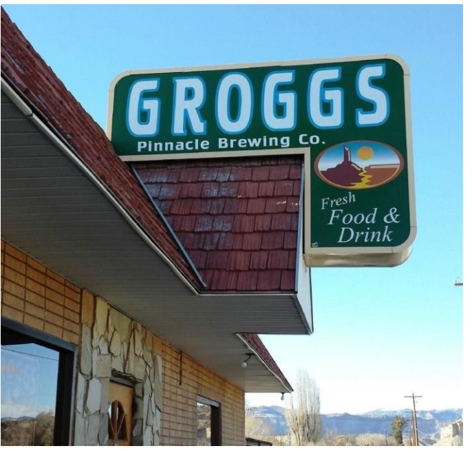
in Price? Yes, in- 3. Grogg's Pinnacle Brewing Co., Price 6. Vernal Brewing

Their restaurant sources everything locally, Kamas