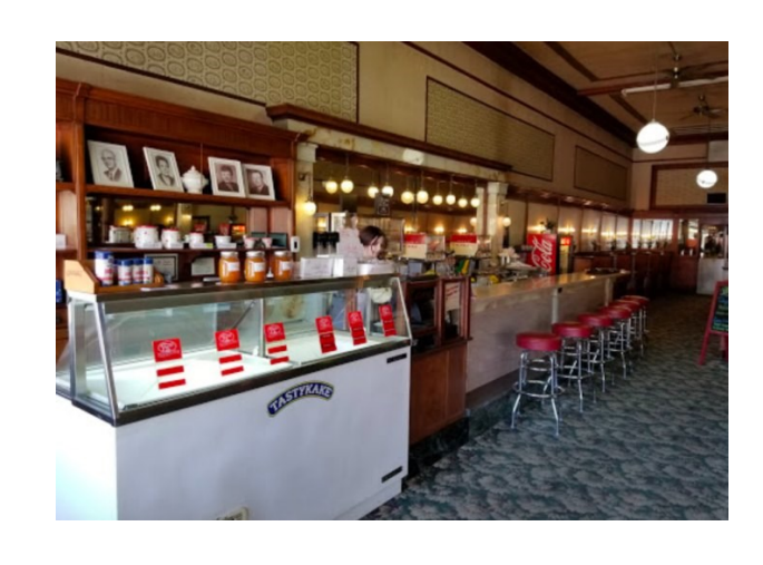
9. Idle Isle Cafe, Brigham City