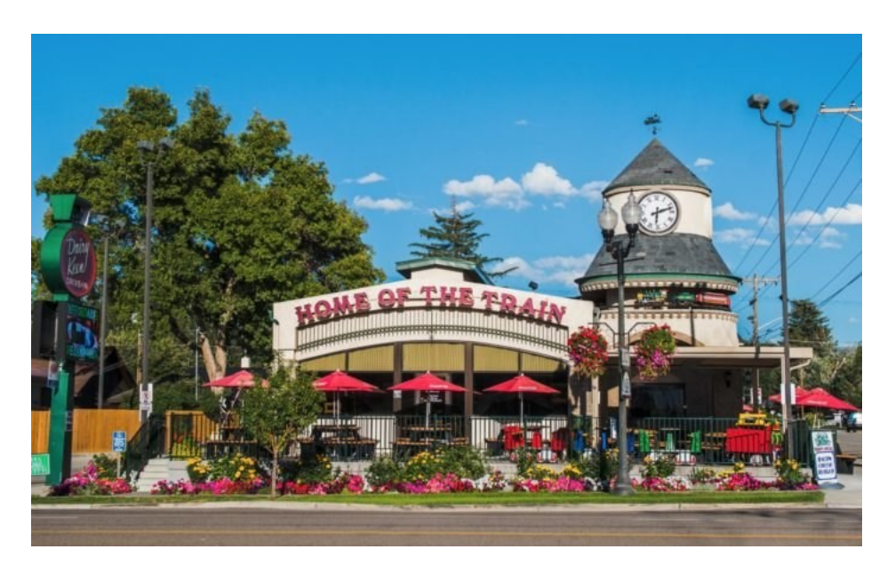
11. Dairy Keen - Home of the Train,