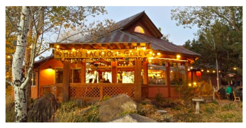
4. Hells Backbone Grill, Boulder

the menu changes with the season. It's received multiple awards and has been a James Beard Award semi-finalist. You'll understand why