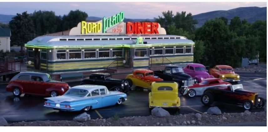
2. Road Island Diner, Oakley

derful, please take proper precautions or add them to your bucket list to see at a later date. If