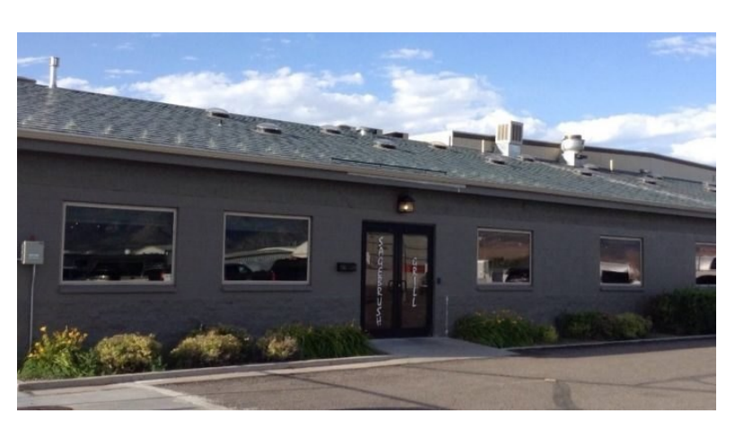
10. Sagebrush Grill, Richfield