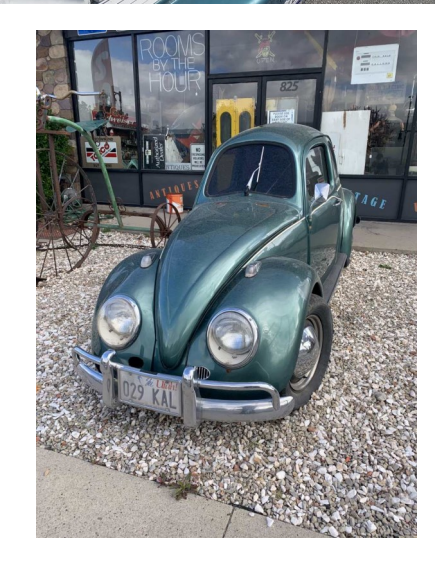
Here's a local one—at American Rust at 825 E 2100 S in Salt Lake City