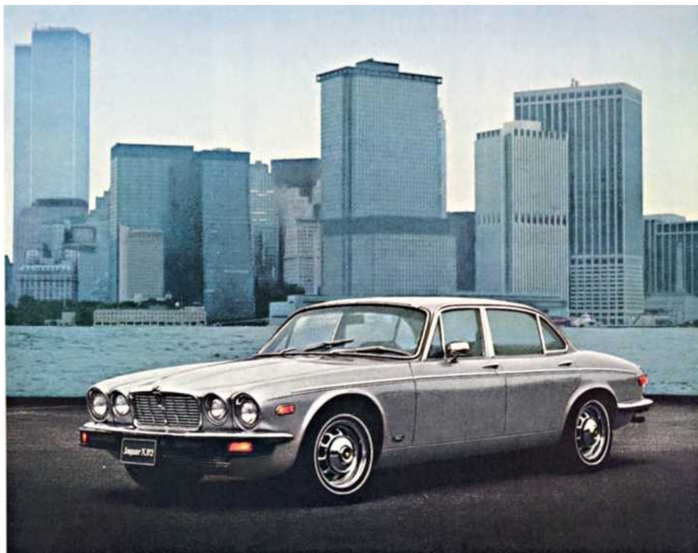
From a Jaguar XJ12 advert