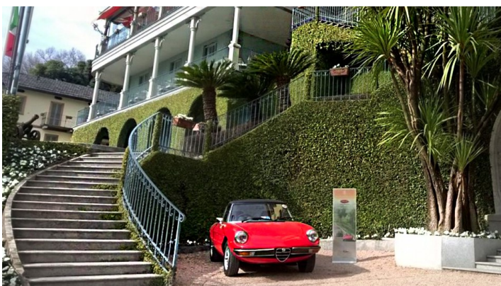
Grand Hotel Tremezzo