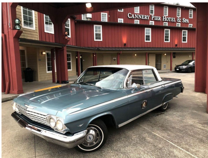
Cannery Pier Hotel & Spa, Astoria Oregon

Italy, of course, is known for romance, and if you book the Grand Hotel Tremezzo and wish to rent its vintage Alfa Romeo Duetto Spider, they offer three packages: "Treat Myself," "I'm in Love" and "I Just Can't Get Enough," the names referring to the amount of time you wish to rent the car - two hours, a full day or two days. They'll also provide you with an itinerary if you wish, which includes Villa Passalacqua, built in the 1700s. The hotel itself, and its surrounding landscape, is stunning,