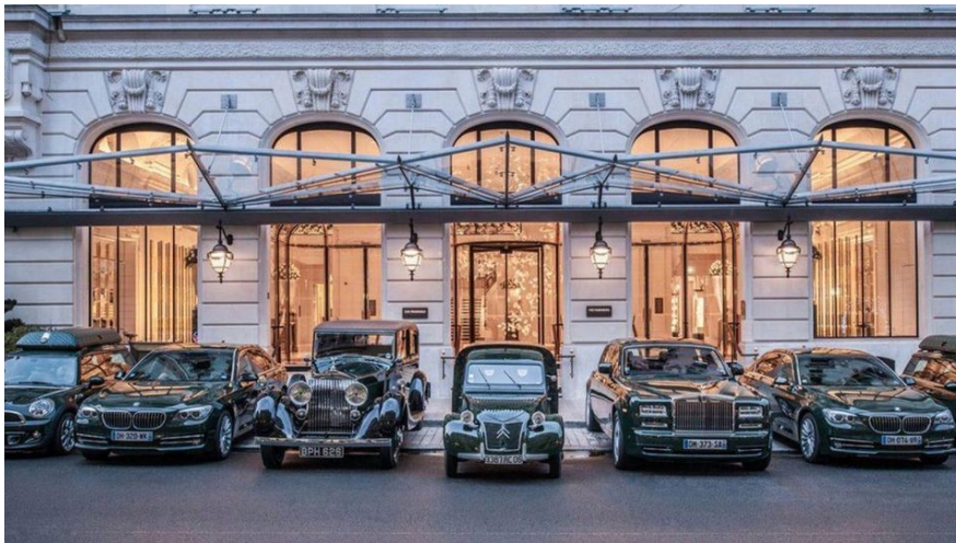
The Peninsula Paris

It's nice to admire classic cars, but it's even nicer to drive or be driven in one, and even nicer when it happens at a 5-star hotel. Here are five properties who offer classic cars to guests, and which cars they're offering.