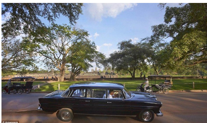
Amansara, Siem Reap, Cambodia

an art nouveau masterpiece sitting on the western shores of Lake Como. Views span the crystalline waters toward Bellagio and the Grigne mountains, and guests are treated to 5-star amenities, three pools, a lakeside private beach and a lavish private park.