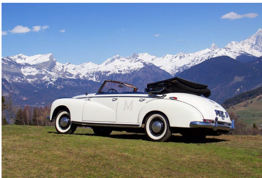
M de Mageve

To celebrate this summer opening, Le M de Megève - a member of the Megève