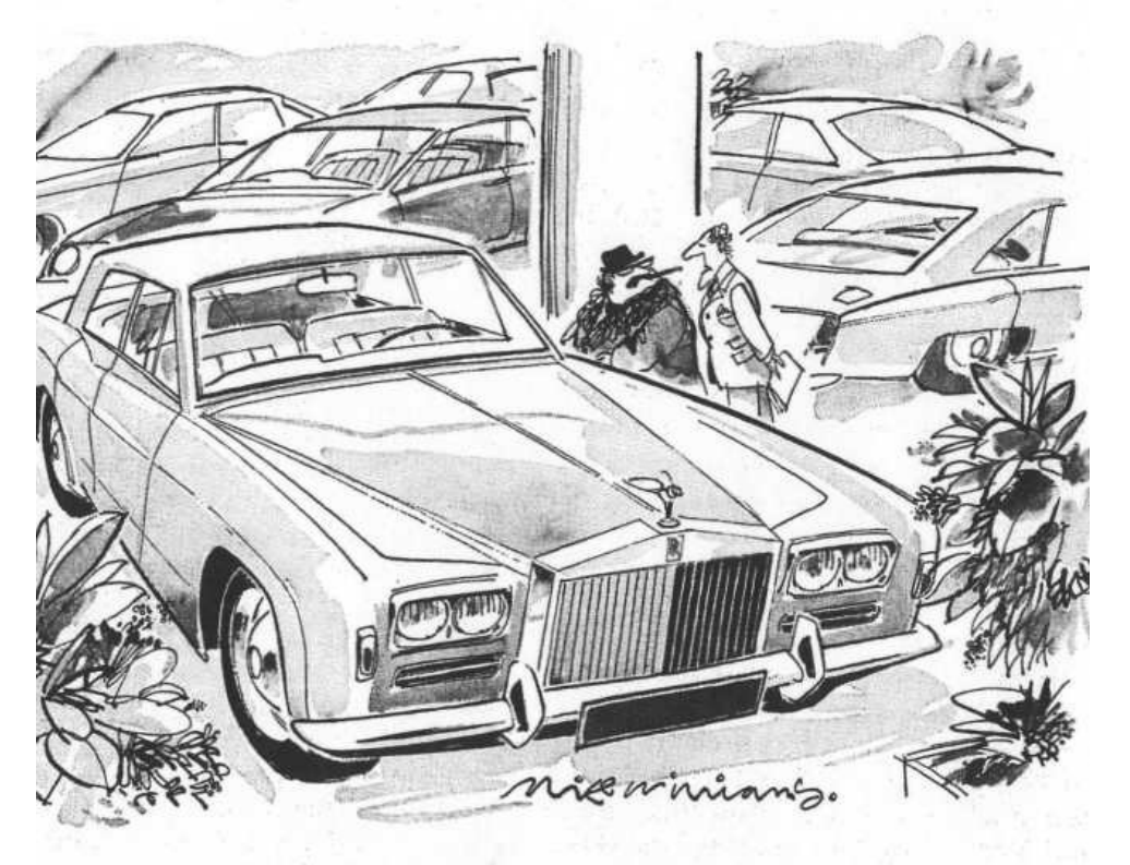
"Naturally you like it, sir, but I'm not quite sure if it likes you."