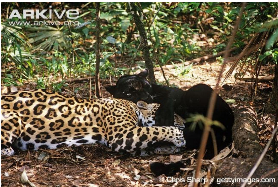
Jaguars showing melanistic and non-melanistic forms

The jaguar is classified as Near Threatened (NT) on the IUCN Red List , and listed under Appen-