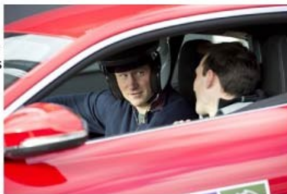
Prince Harry on-track in a Jaguar F-Type.