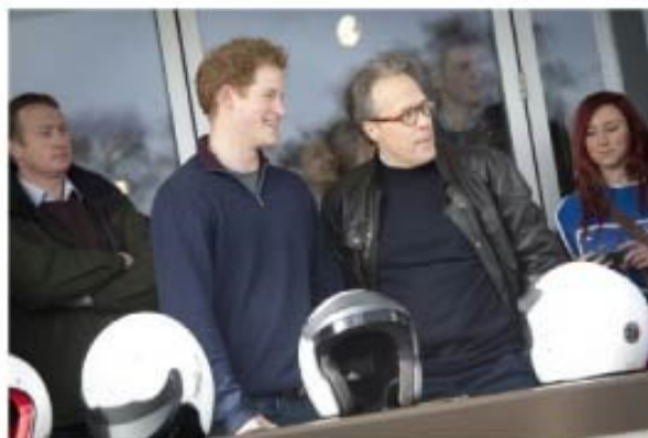
Prince Harry with Goodwood owner Lord March.

Lord March said: "We're delighted to have Prince Harry attend a track day here at the Goodwood Motor Circuit and to support the work of the Royal Foundation Endeavour Fund, which has established some wonderful projects to help injured service personnel. As a former Royal Air Force base, Goodwood has a connection with military service that stretches back 75 years, so it's something that we feel quite a part of."