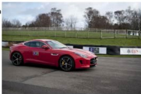
Prince Harry getting ready to drive a Jaguar F-Type.