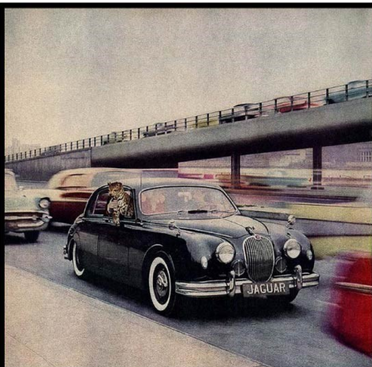
JAGUAR 3.4 SEDAN

Only 7,500 Americans can get a new Jaguar this year . . . Naturally, Jaguars are scarce. You just can't mass-produce a superb car like the Jaguar unless you compromise your standards. We won't. Witness: the painstaking workmanship in the lithe, low body, the hand-finished interiors, the watchmakers' precision in the magnificently coordinated power plant.