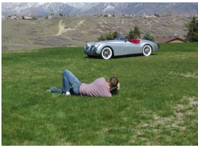
Which do you prefer? The 1948 original, or the 2013 adaptation?