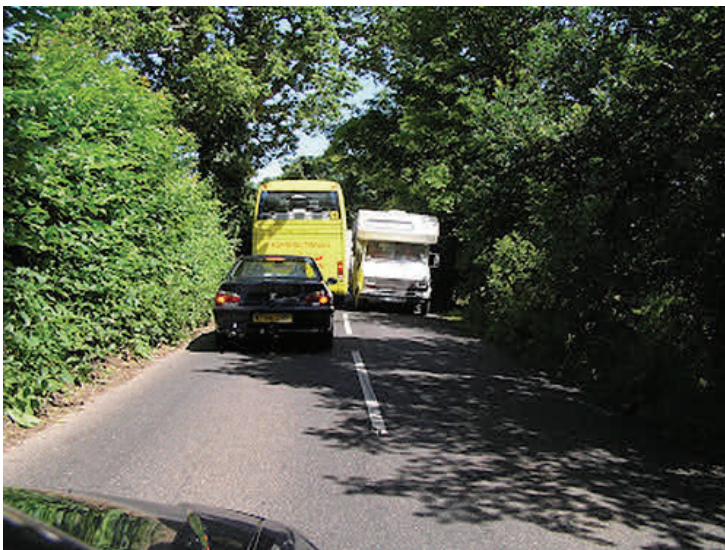
Squeezing by on a two lane country road.

I feel like close calls occur for everyone at least three times a day here. In the U.S. a close call may result in this reaction from the opposite driver: middle finger waving, profanities shouted at you, and they may follow you just to be a jerk. (I must admit I am guilty of all three.)