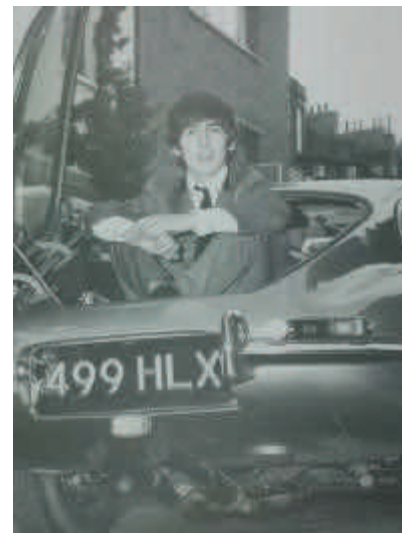
Can you name the Beetle?