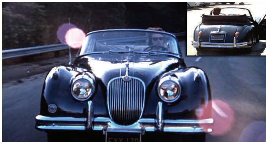
Clint Eastwood in Play Misty for Me —see p. 1