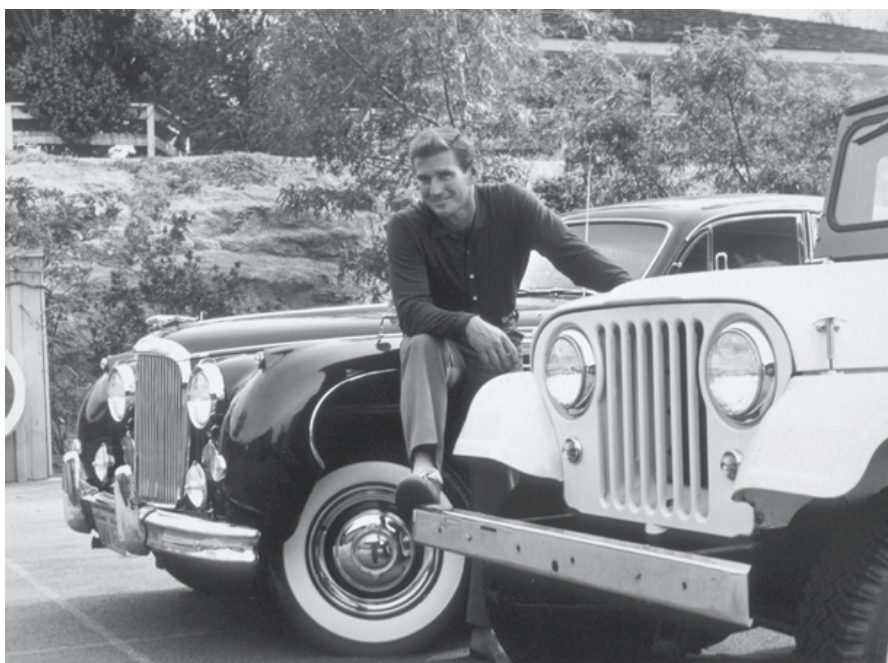
Rod Taylor and his Mark VIII