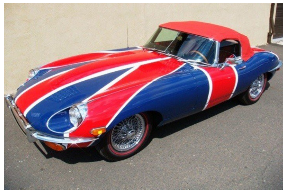
The famous Shaguar E-type from the Austin Powers movies.

Here are a few movies involving models owned by WMJR club members: