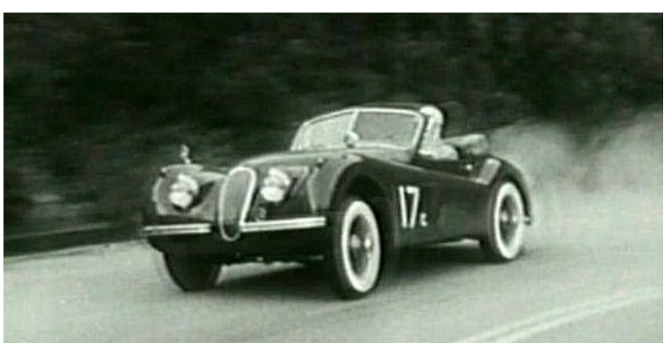
XK120 drop head coupe in The Fast and Furious (1955) race scene

1) <u>C'etait un Rendezvous</u>, a wordless 9 minute short by French director Claude Lelouch featuring an unedited take of a high speed drive through almost empty Paris streets, captured by a camera on the