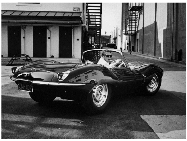
Steve McQueen in his 1956 Jaguar XKSS

litre in-line sixes -- detuned from 265 horsepower to 195 -- powered more than 1,200 Scorpion armoured reconnaissance vehicles. Armed with 76-millimetre main gun and 7.62-mm machine guns, the Scorpion featured much use of aluminum and other light-weight