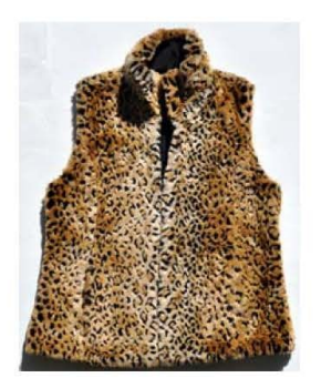
Women's jaguar fleece vest, WITHOUT JCNA Logo, $55