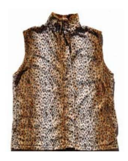
Women's jaguar print vest WITHOUT JCNA Logo, $45