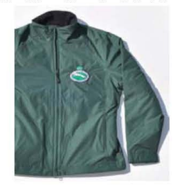
Women's Lined Jacket, $65