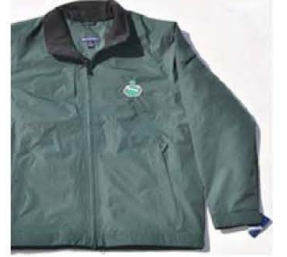
Men's Lined Jacket, $65