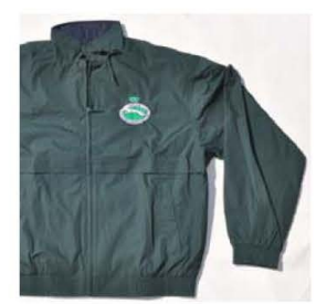
Men's Windbreaker $55