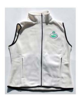
Women's White Vest with JCNA Logo $45