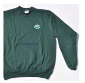
Men's and Women's Sweatshirt, $35