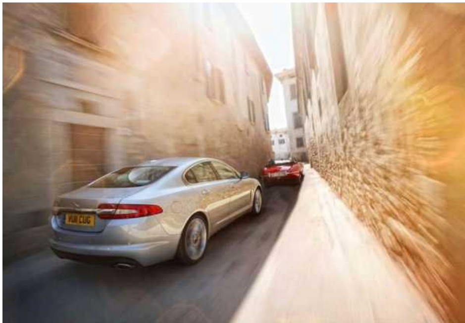
A 2011 XJ pursues an E-type through the streets of Milan in advance of the Mille Miglia

they really belong: competing with other classic sports cars on the open road. This year's full representation also provides a fitting way to celebrate an important milestone for the marque. Furthermore,