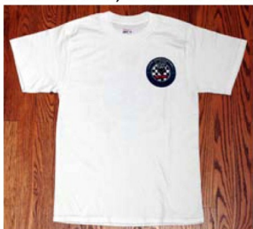
Short Sleeve T-Shirt Front and Back $14