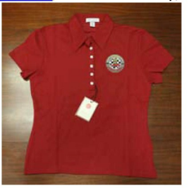
Ladies Polo, $39