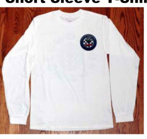
Long Sleeve T-Shirt Front and Back $15