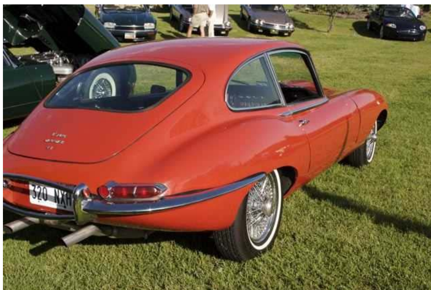
The Neilsons' 1968 Series 2 E-type 2+2 in Signal Red

trict. She now does the same thing but for the Canyon School District.