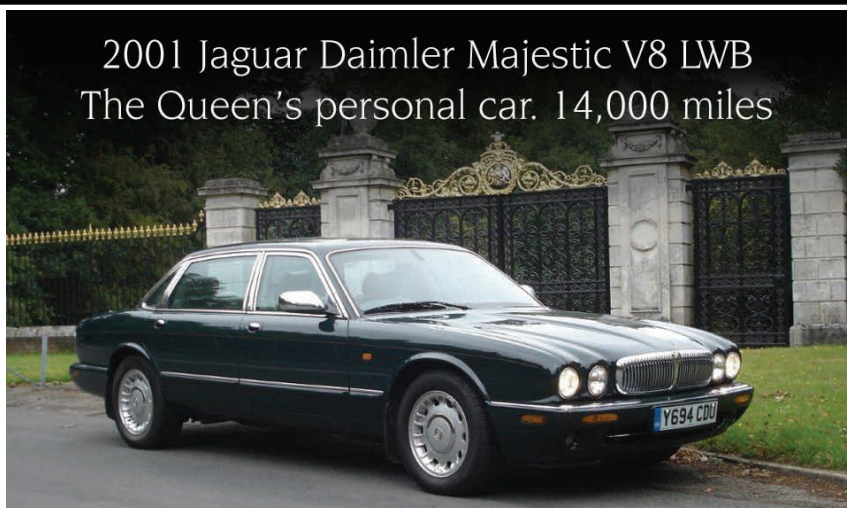
2001 Jaguar Daimler Majestic V8 LWB The Queen's personal car. 14,000 miles